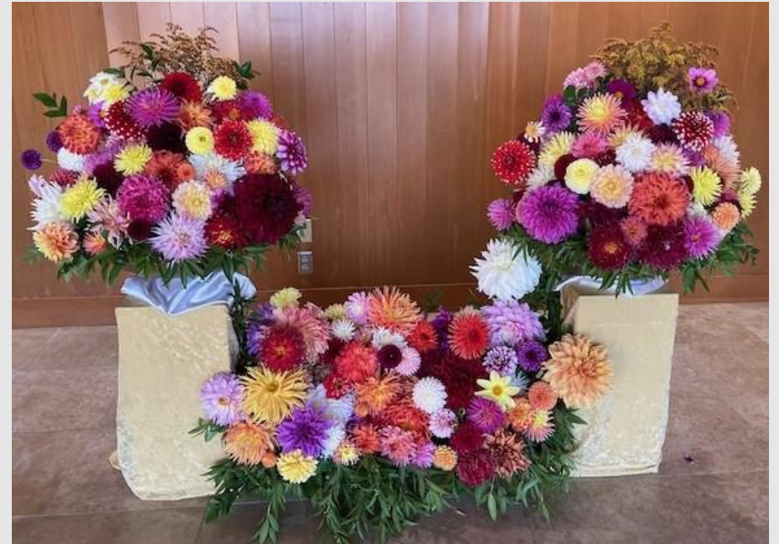
The Photo Booth