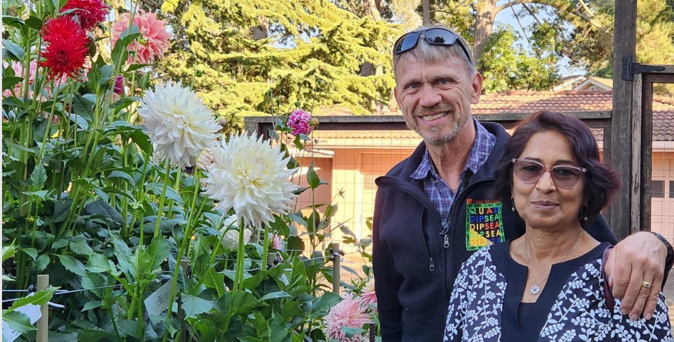
Eldridge family photo in the garden