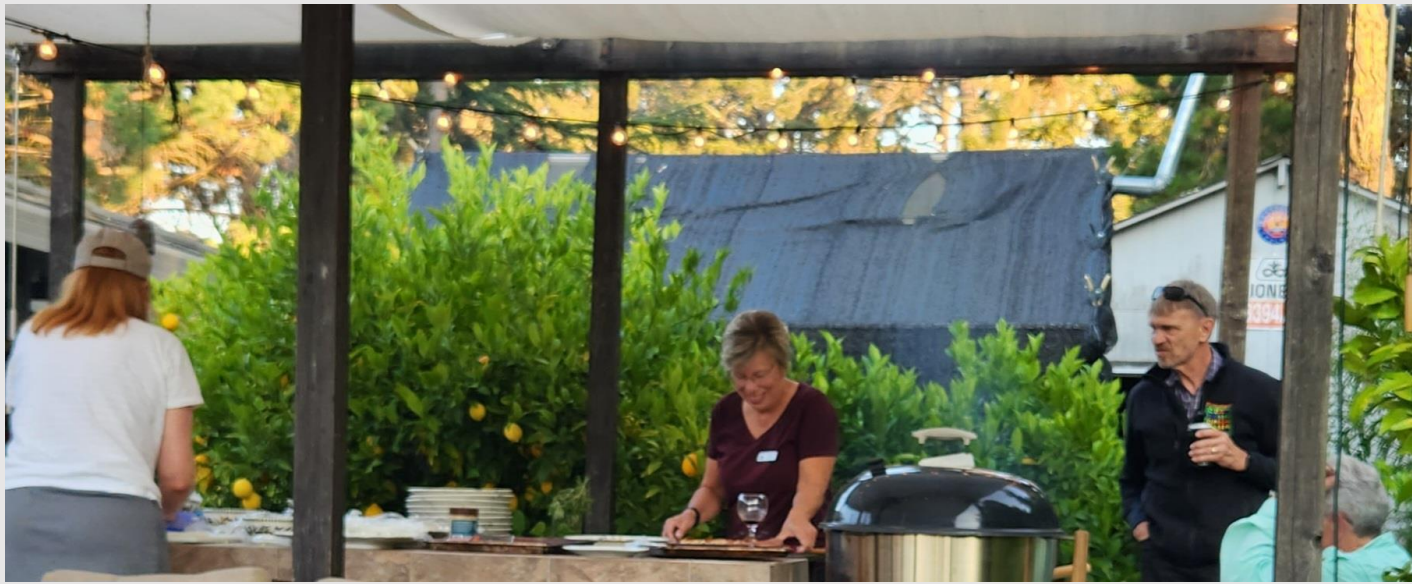
The pizza crew