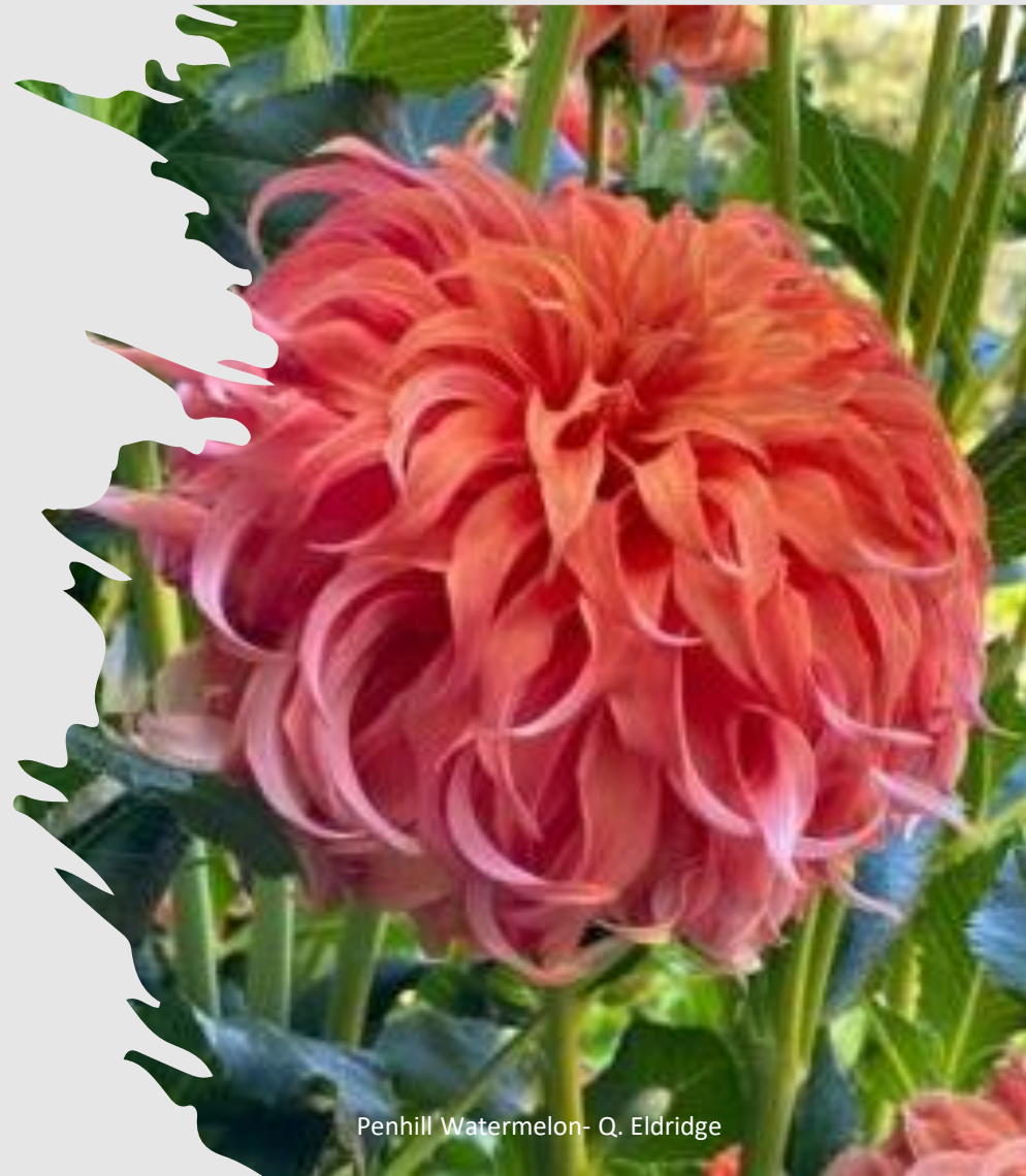
Penhill Watermelon- Q. Eldridge