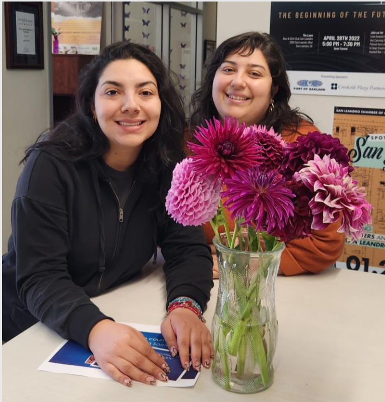
Blooms at Chamber of Commerce