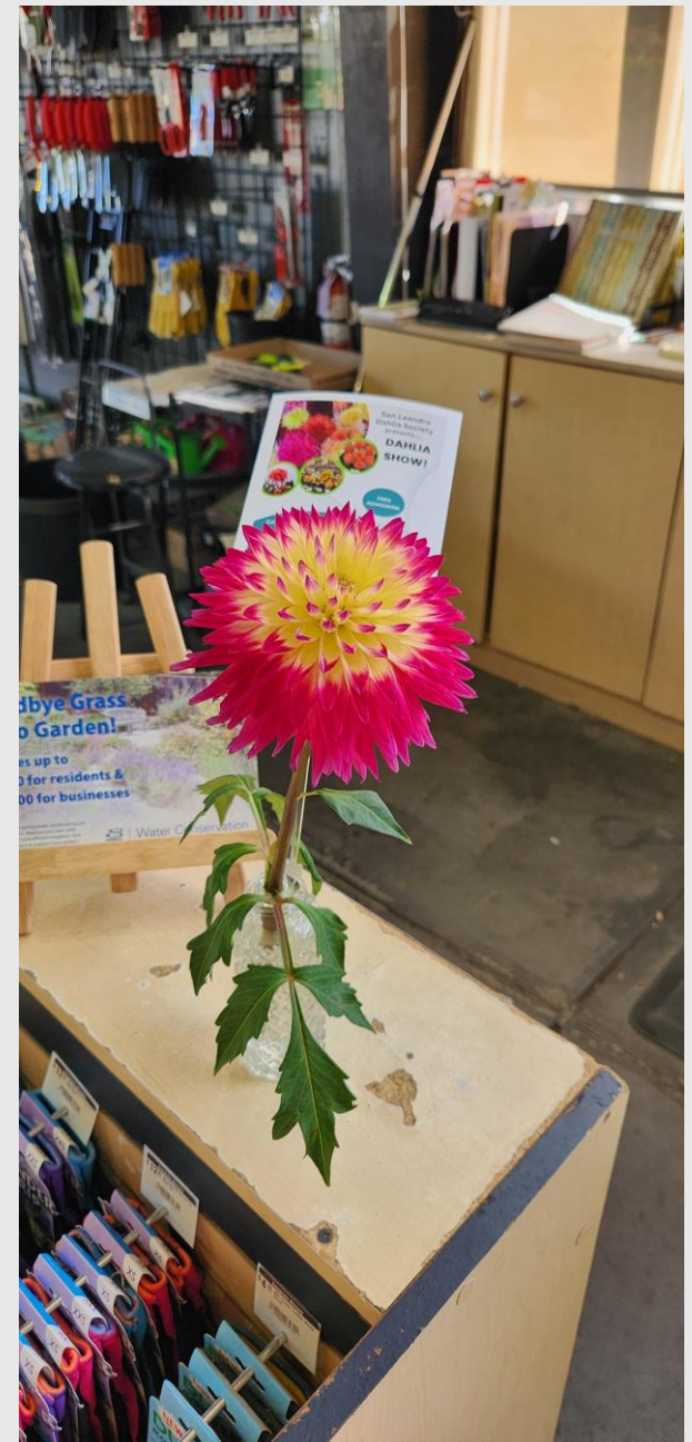
Bloom at Evergreen Nursery

Ask your local hardware store, coffee shop, hairdresser, barbershop, bank, garden store, church, nail salon, restaurant, workplace that you frequent to “ADOPT A DAHLIA”. Pick one of these spots and ask if they would like you to bring a single dahlia bloom from your garden (or ask a society member, if you are short) each week to display at for the public. A bud vase or small jar container is all you need and the commitment to stop by weekly and replace the bloom. Attach one of our mini show flyers next to it. The shop’s commitment is to refresh the water when needed. Evergreen Nursery adopted a dahlia this week and they tell me that the customers and staff are raving about the blooms at the check out counter.