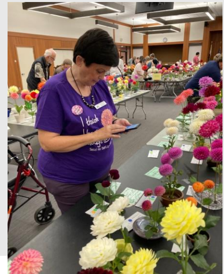
Clerk entering data on her phone